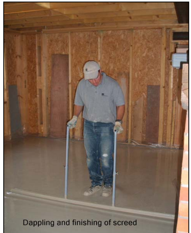
Dappling and finishing of screed