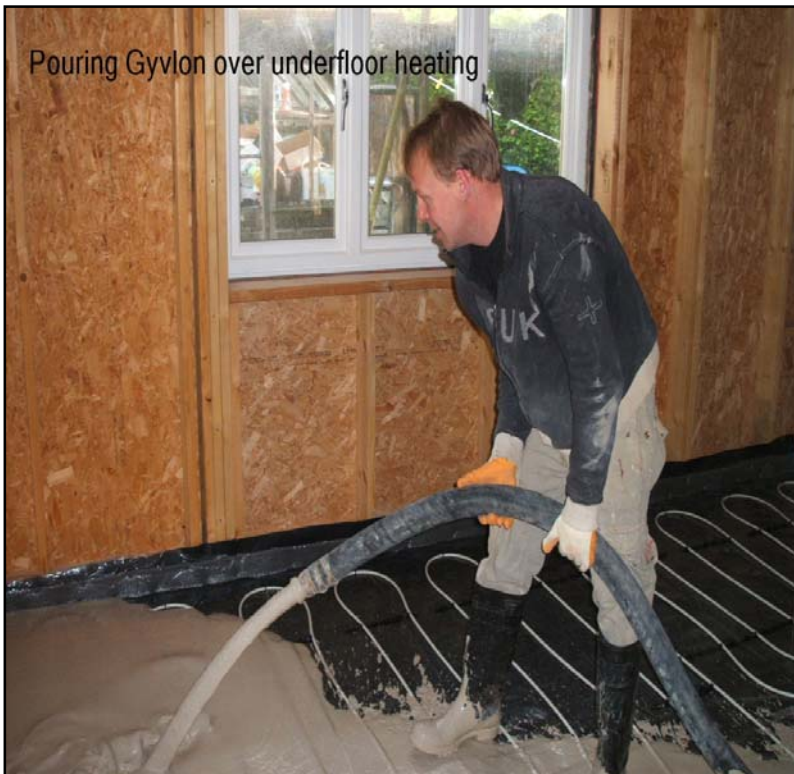
Pouring Gyvlon over underfloor heating